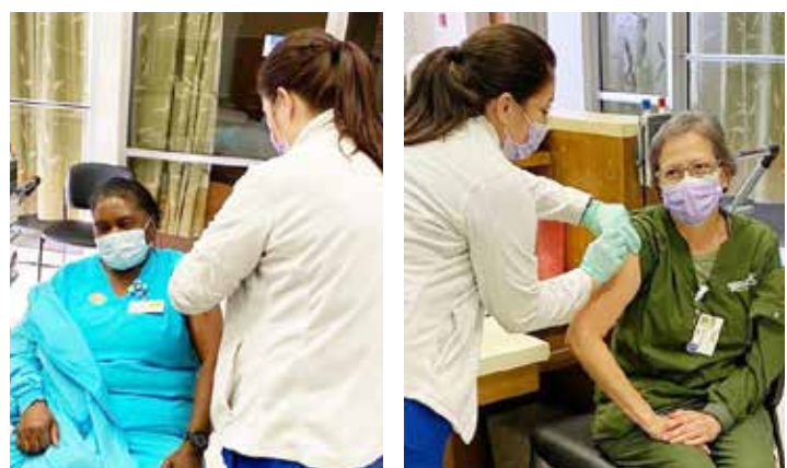
Shown in the photos at left, staff of Pointe Coupee General Hospital get their COVID vaccinations.