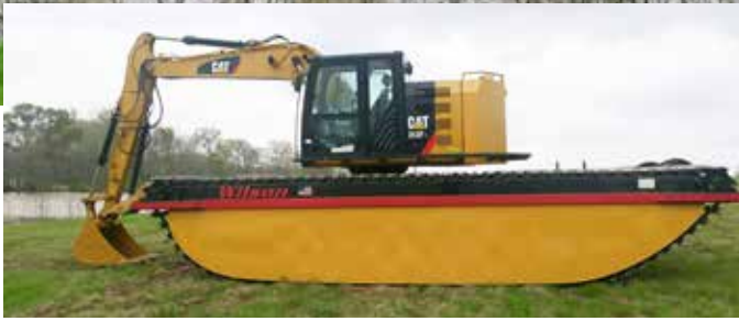
Shown above is the dredging machine which sucks silt from the bottom of Johnson Bayou and disposes of it in the Atchafalaya Basin. At left is the swamp excavator being used to clear trees and stumps from a portion of Johnson Bayou.