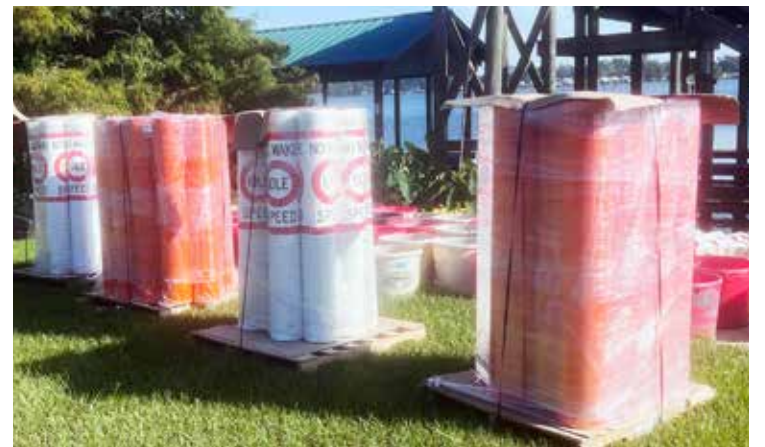
Bouys ready to be replaced in False River.

The parish has conducted an inspection of all the bouys to see if they are damaged or missing, and expects to replace approximately 30 bouys this year.