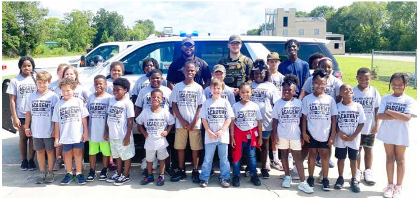
Deputies are shown with some of the kids who participated in the 2022 First Responder Junior Academy.

The program is FREE of charge and opened to all children throughout the parish ages 7 – 14. Registration forms can be picked up at the City of New Roads or Pointe Coupee Parish Sheriff's Office in the Parish Courthouse in New Roads.