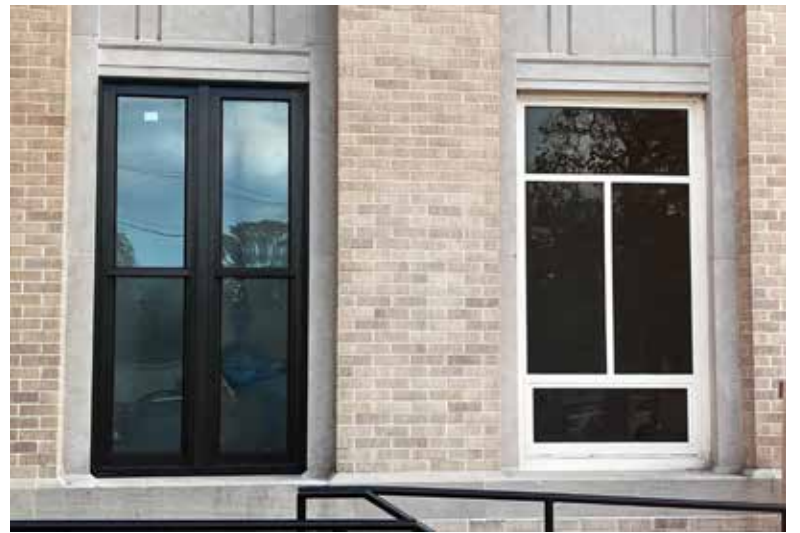
The photo shows the new courthouse windows, at left, and an old window at right. The new double-paned windows will provide better operation and energy savings.

One of the most significant de-snagging and clearing out drainage projects in Pointe Coupee history will begin this year. The clearing, grubbing and shaping of Grosse Tete Bayou and Bayou Cholpe north and south of La. Hwy. 190 will go out for bid in mid-2025 and will begin before the end of the year. These bayous drain two-thirds of Pointe Coupee Parish, and have not been cleaned out in over 40 years. This project will result in quicker drainage flow throughout the parish.