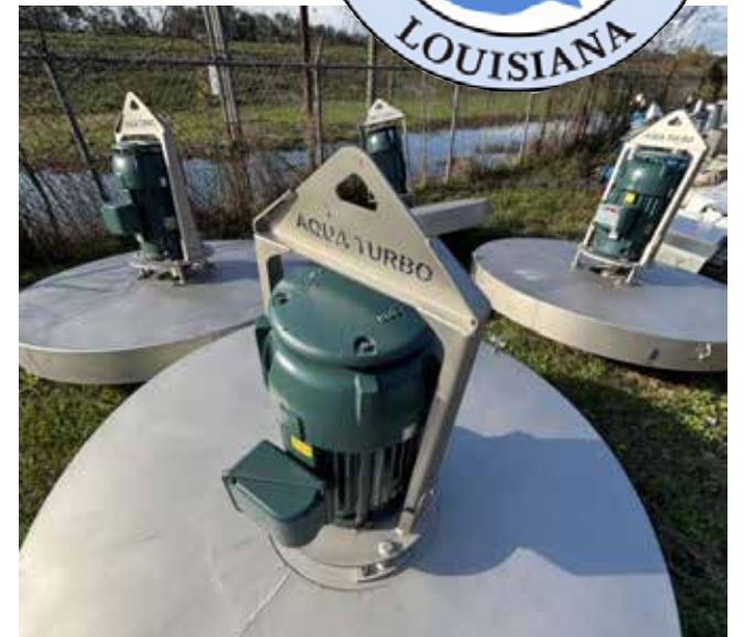
A set of 4 new lagoon aerators to increase airflow to the lagoons.

The city received 78 percent of funding from federal grants, and will use its federal COVID relief funding, local funds, some parish federal COVID relief funds for the city match, plus a bond issue to pay the remainder of the cost for the much-needed project.