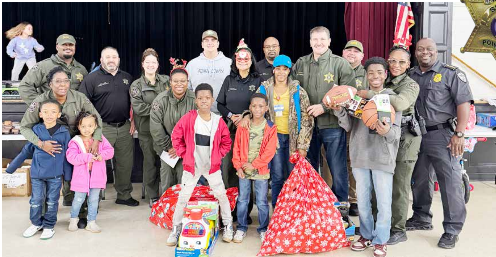
Kids, and deputies enjoy the Gift of Giving event.