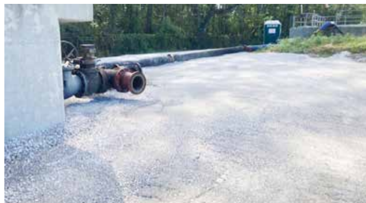
The piping yard has a fresh layer of gravel. The pipe yard was mostly mud prior to this project. The pipe seen is the bypass pump pipe while new pumps are installed.