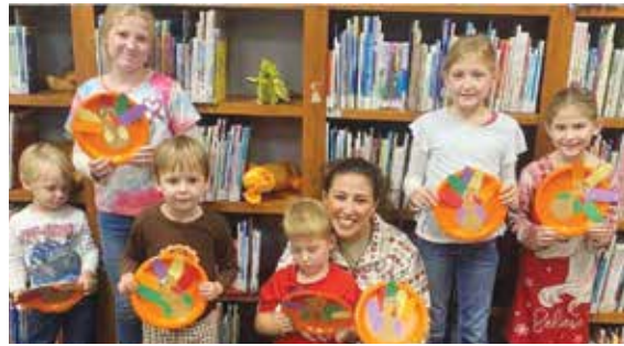
The Innis Branch celebrated Thanksgiving and Christmas with plenty of children's activities. The photos at left show some of those activities. The other PC Library branches also offered holiday programs for the children.