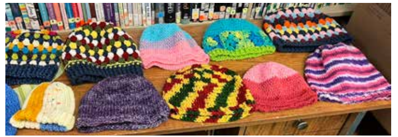
CROCHET AT JULIAN POYDRAS BRANCH... Beginner crochet lessons are provided for adults on Mondays from 9 am until 3 pm. Supplies are provided. The Head Hugs Hats project is also on-going! Pick up one hat per person at library for free while supplies last. For more information, please call 225-627-5846.