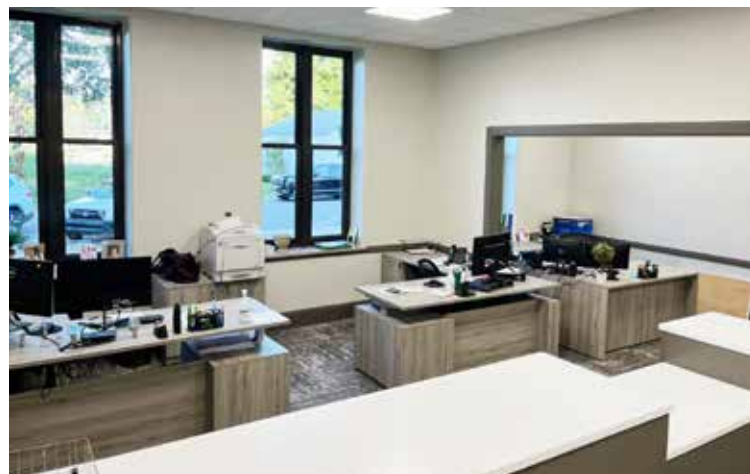
Shown in the photos above is some of the new office space of the newly renovated Assessor's Office.

There are a lot of things taking place here in Pointe Coupee this fall. Area schools are midway into football season, harvest season has begun on area farms, and outdoor enthusiasts will soon head afield for hunting season.