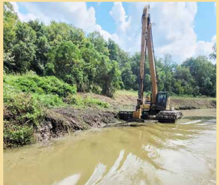
Bank of Bayou Grosse Tete is cleared of vegetation.

The entire project is being funded with state capital outlay funds, thanks to the efforts of Senator Caleb Kleinpeter and State Rep. Jeremy LaCombe.