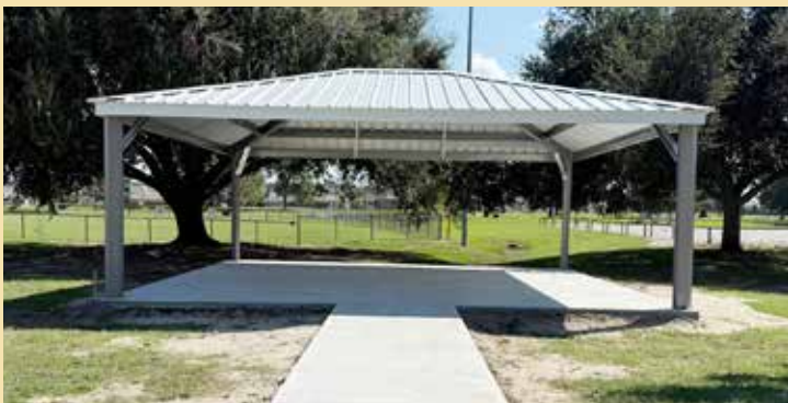
Ball field renovations are complete at False River Park, and a new 30 ft. X 30 ft. pavilion, donated by Friends of False River Park, is almost complete. Work is shown in the above photos. In addition, the renovation of both entrances to the Multi-Use Center is complete. That project involved replacing old culverts and adding concrete aprons at the entrances.