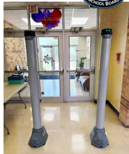
Shown above is the single point entry, and at left are security doors installed at all schools.