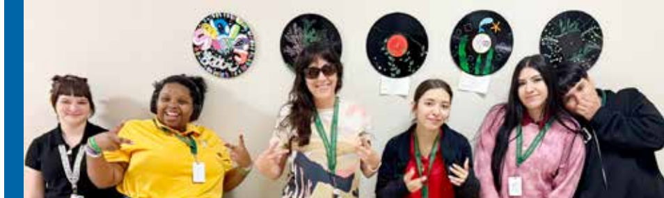
The Rotating Visual Arts Program unites schools through creativity.