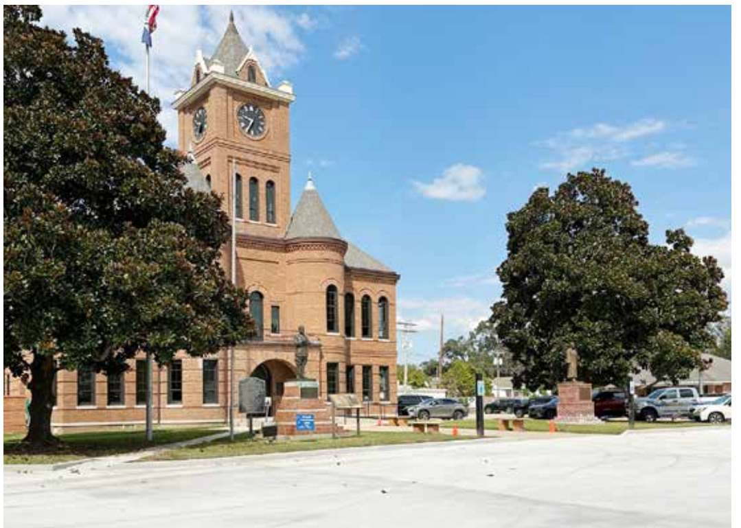
Shown in the top photo is the beautiful new main courtroom of the courthouse. The photo above shows a portion of the newly-paved concrete parking area in front of the courthouse.