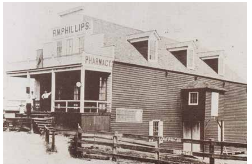
This photo of the old R.M. Phillips Pharmacy in New Roads is one of many historic photos that the Pointe Coupee Library maintains in its digital collection. The photos are posted on the Library's facebook page: Pointe Coupee Parish Library ll. Photos are being sought for the collection. Call 225-638-9847 for more information.