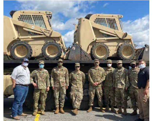
The parish planned for five hurricanes or major storms in 2020, and also cleaned up debris on roadways and public properties after the storms. The top photo shows a portion of the clean-up after Hurricane Delta. In the bottom photo, Parish President Major Thibaut is shown with La. National Guard personnel after he secured the Guard’s assistance and its equipment to clear downed trees on roadways after Delta.