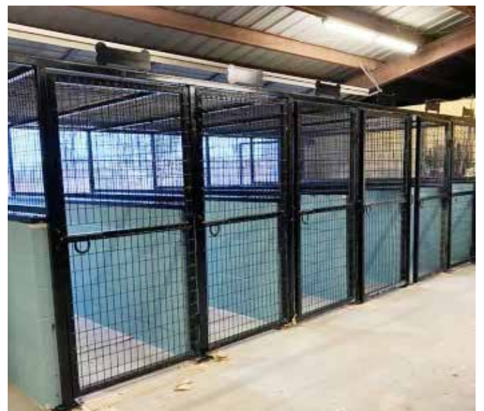
Shown above at left is a small portion of the 43.91 miles of roadside ditches that were dug in 2020. Shown at right is a portion of the renovated Pointe Coupee Animal Shelter. Animal control services and pet adoptions were greatly improved in 2020.

PRSR STD U.S. POSTAGE PAID BATON ROUGE, LA PERMIT NO. 88