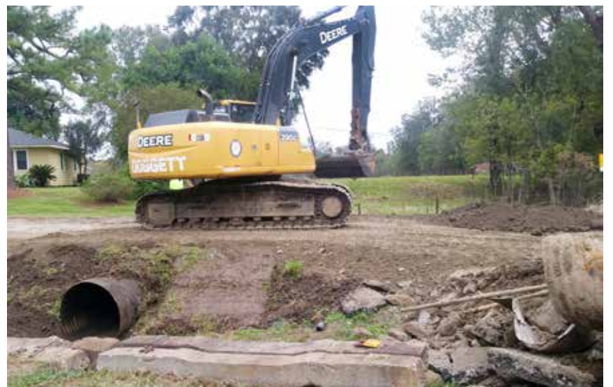
Crews dug out 16.74 miles of road-side ditches and 15.25 miles of watershed canals in 2019.

(see above at left), website and facebook page to make government more efficient and transparent, and to keep pace with modern communication tools. The new website provides detailed information and the ability for residents to submit work requests, pay utility bills, apply for permits and register for recreation programs. The new website is www.pcparrish.org . The facebook page can be found at: facebook.com/PCParishGov .