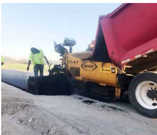
Part of the $1.1 million in road improvements completed in 2019.

#4 - Developed a 5-year capital outlay plan to provide for major road, bridge and drainage improvements,