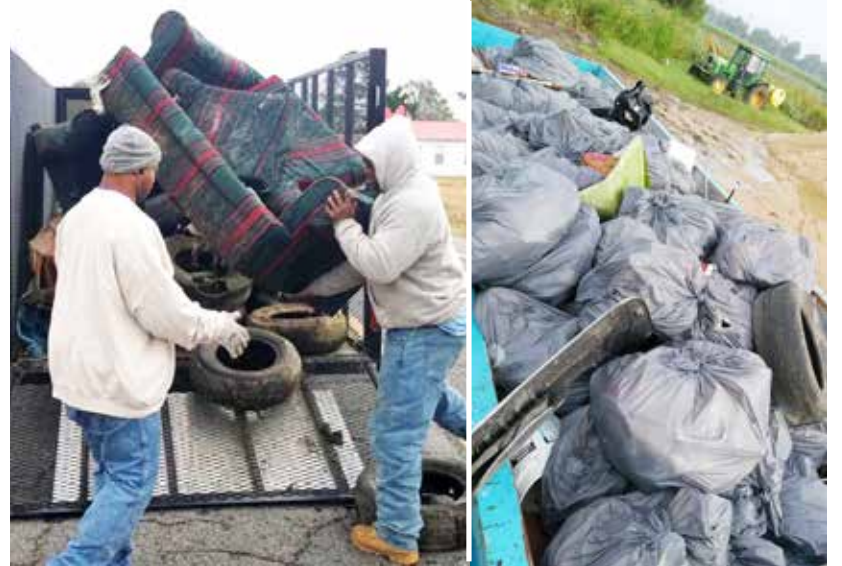
Small portion of litter collected under the new Litter Abatement Program. A total of 800 cubic yards of litter and trash were collected in 2019.

The parish's new mosquito abatement program with Mosquito Control Services provides a $42,000 savings AND provides science-based testing and analysis to pinpoint aerial and truck spraying and chemicals needed for better mosquito control. During 2019, a total of 248,284.5 acres were sprayed by truck and plane.