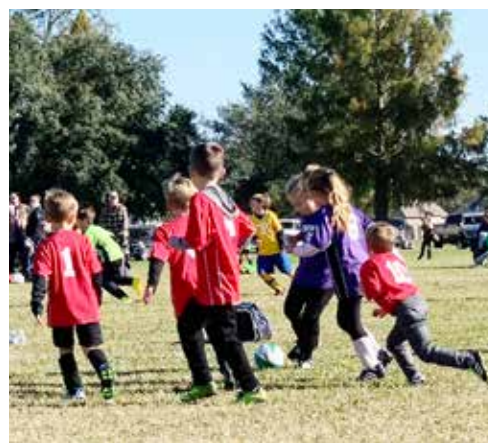
A soccer game underway during the fall soccer league.

#2 - A five-stall livestock wash rack has been added at the Pointe Coupee Multi-Use Center , thanks to a grant obtained from the Pennington Family Foundation.