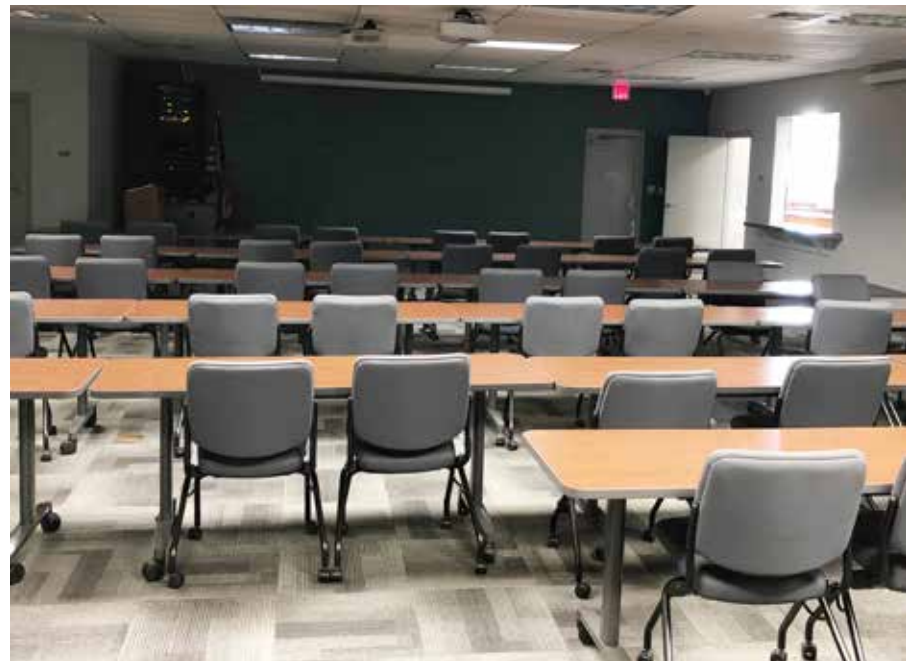
The Pointe Coupee Sheriff's Office dispatch room.