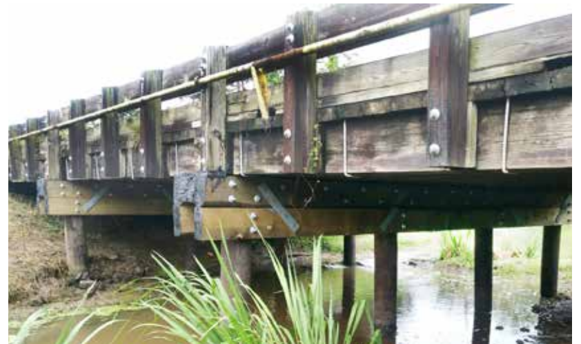
Repairs to Lorio Dairy and Woodview Lane Bridges have been completed so that their higher load ratings could be renewed.